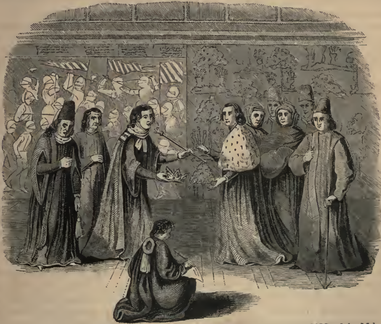
RICHARD II. RESIGNING THE CROWN INTO THE HANDS OF THE DUKE OF LANCASTER. From MSS. of the 15th Century.

"With regard to me, I have taken you under my protection, and will guard and preserve your life, through compassion, as long as I shall be able. I will likewise entreat the Londoners in your behalf, and the heirs of those you have put to death." "Many thanks,"